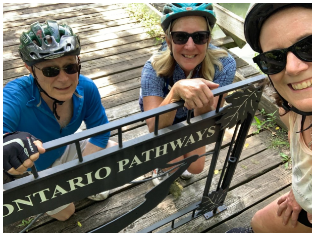
August 12- Ganondagan State Historic Site.

Eight hikers enjoyed a beautiful morning on the trails at Ganondagan, Fort Hill and Dryer Road Park, covering 5.7 miles in 2.5 hours.